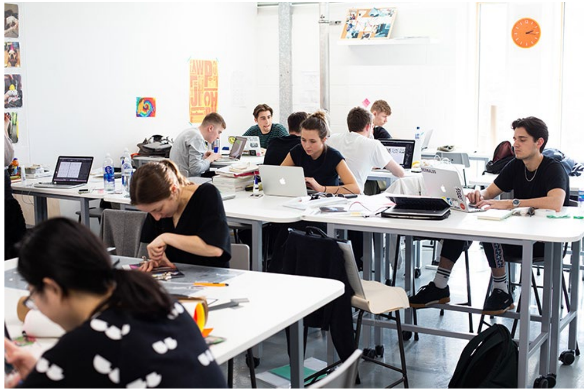
Access and Participation Plan

our students and the community as a whole. The <u>Equality</u>, <u>Diversity and Inclusion Policy</u> describes how we will promote equality, diversity and inclusion as well as tackle and eliminate discrimination. You can find the full policy on the Academic Regulations pages on the portal. You can also find the annual Equality, Diversity and Inclusion reports relating to students and staff on the University website.