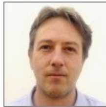
Adam Stone Fine Art